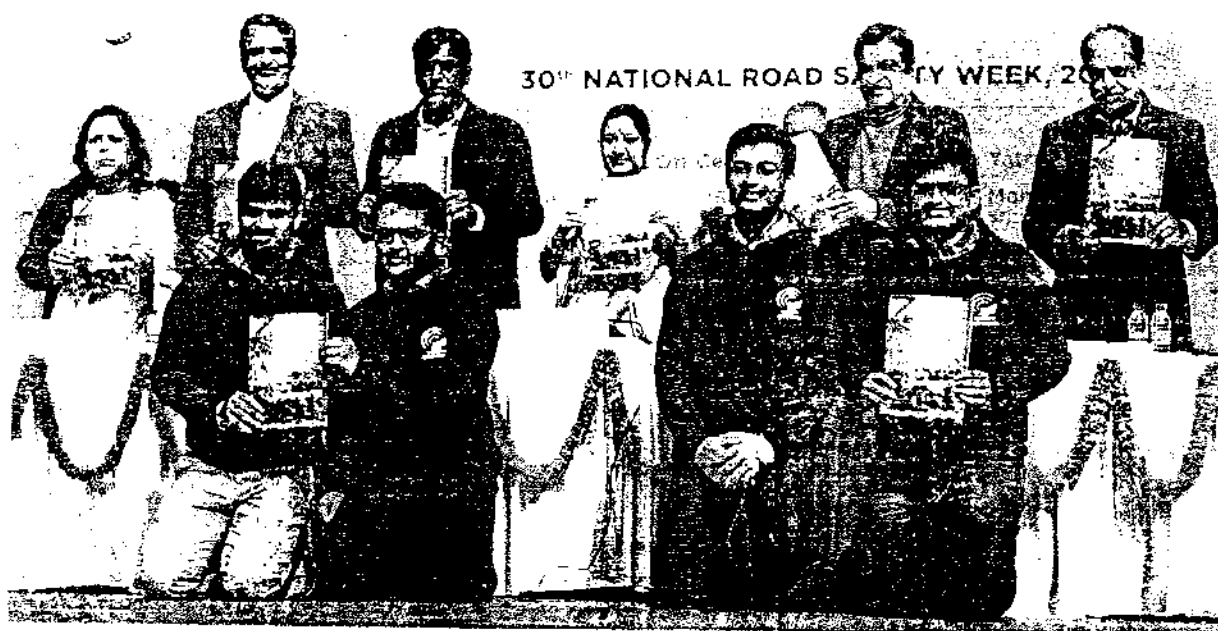
Launch of iSAFE'19 by Shri Nitin Gadkari and Smt Sushma Swaraj at Rajghat

iSAFE'19 was marked open by the Hon'ble Union Minister of Road Transport and Highways, Shri Nitin Gadkari and Hon'ble Union Minister of External Affairs, Smt. Sushma Swaraj at Rajghat during the launch of the 30th National Road Safety Week on 4th February 2019. This year the target is to reach more than 5000+ colleges and 5000+ schools all across India with the vision to promote Safer India by participative engagement of the youth all across India through partnerships with the state ministries/institutions across India.